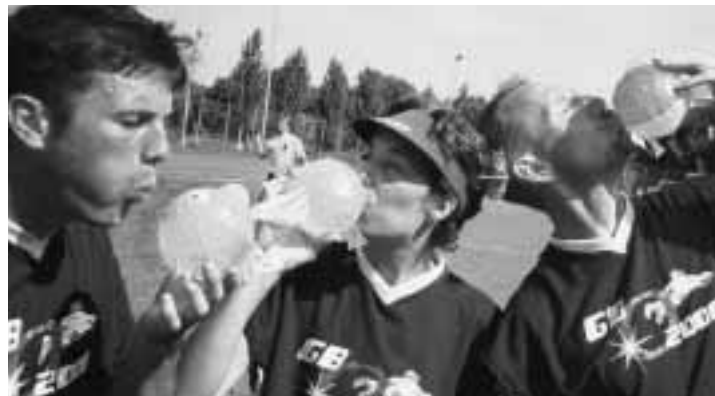
GB COED TEAM BLOWING FISH, ULTIMATE WORLD CHAMPIONSHIPS 2000, HEILBRONN GERMANY