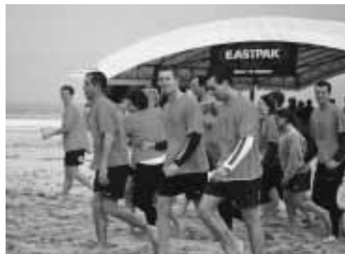
PELDI LAYS OUT