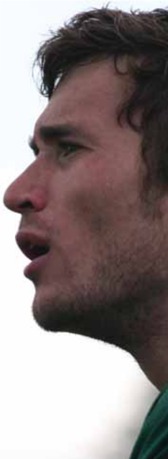
RODDERS: "OH NO, NOT SECOND PLACE AGAIN"

"No, this is Dan, from your mother's church - is that you William?"