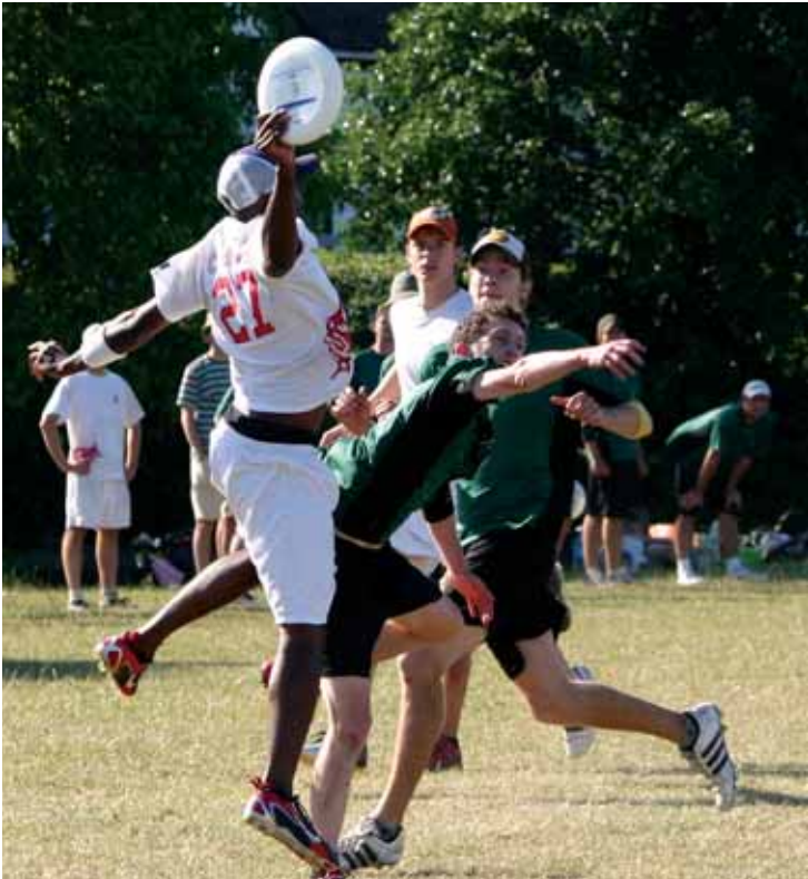
The Tour format remains unchanged for next year and promises to be even more exciting with more teams queuing up to get in on a piece of the action.

Paddy Murphy put up a good show throughout the tour to see them improve on their 2005 Tour ranking by 6 places. However, this years Cinderella story has to go to the Mild Mannered Janitors who proved that training and youth isn't really all it's made out to be. Despite missing a Tour due to an inconveniently scheduled wedding, the what can only be described as a veteran team worked hard throughout the season to increase their Tour finishing by 9 places.